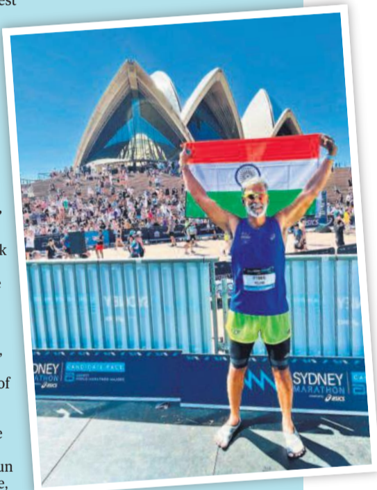
Milind Soman at the Sydney Marathon

"Have fun, do not be too hard on yourself and learn from your experience of preparation for the challenge every day," Soman wraps up, with a piece of advice for aspiring runners.