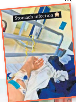
Jasmin Bhasin; (inset) her Insta Story

Meanwhile, actor Jasmin Bhasin was also admitted in a hospital due to stomach infection. The actor posted on Instagram Stories a picture from the hospital, resting on a bed. She wrote alongside the picture, "Stomach infection".