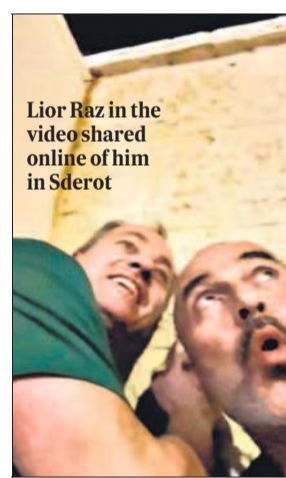
Lior Raz in the video shared online of him in Sderot

Israeli artiste Lior Raz has stepped up to safeguard the people of his country amid the war situation in